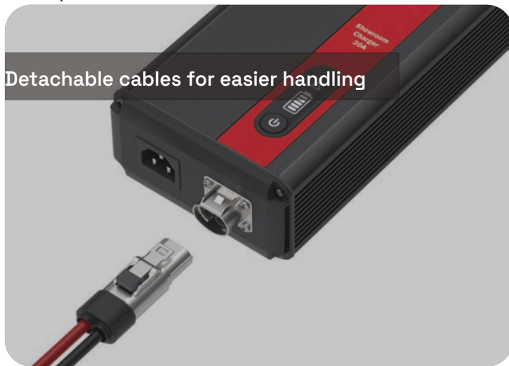
Detachable cables for easier handling

Keep your vehicles fully functional, ready for demonstration in a clean looking showroom. The ShowroomCharger 30-32A is our most compact charger, designed using modern switch-mode technology with 7 steps charging curve that optimizes battery performance and longevity. It can be used on all AGM, GEL, EFB and Lead Acids batteries. The charger can be easily placed under the car or the hood, out of view for your customers thanks to its compact size and detachable cables. Rubber feet and corners are available for further protection. You can upgrade the software at any time via the separate USB port.